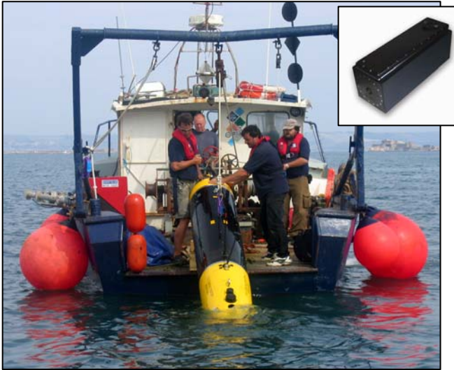
Figure 1 (Above) Operators bring on deck the Bluefin-21 AUV at the end of its mission. The vehicle carries out missions to ocean depths of 4500 meters, and uses li-poly pressure-tolerant battery technology. (Top Right) the 1.5 kW-hr battery pack which powers many AUV systems.

Karen E. Robinson (Bluefin Robotics Corporation) * January 2007