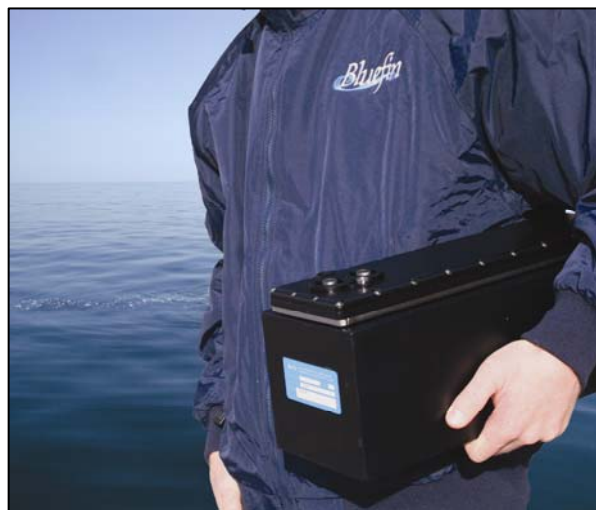
Figure 2 Absent of cumbersome pressure chambers, the Bluefin 1.5kW-hr battery pack is easily swapped out of vehicles.

When Bluefin Robotics began commercially manufacturing AUVs in 1997, the high-energy-density chemistry choice for underwater batteries was silver-zinc, with a typical energy density of 110 to 140 W-hr/kg. From the beginning, the intent was to use the then-mature Ag-Zn batteries, and shift to a lithium-based cell as the battery technology matured. As the young company advanced the technology of its AUVs, engineers soon desired the better performance of lithium-polymer batteries, which was creeping toward 200 W-hr/kg.